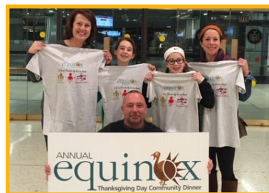
Showing off their 50th Anniversary T-Shirt—one of many families sharing in the T-Day tradition.

Our deepest gratitude to all the individuals, families, businesses, farms, schools, congregations and organizations that contributed food, money, time and hard work! A very special thank you to Tri City Rentals for their generous support of the 50th Equinox Thanksgiving Community Dinner, along with our lead community partners: NYS Office of General Services, Price Chopper/Market 32, Hannaford Supermarkets, NYSCOPBA, and H.L. Gage. We are grateful to all of you—our “T-Day” family—for making our dinner a cherished community tradition.