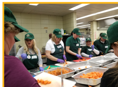
Team of employees from Tri City Rentals joined in the meal preparations on “carrot duty.”